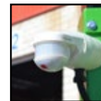
Overview of motion detector for outdoor use